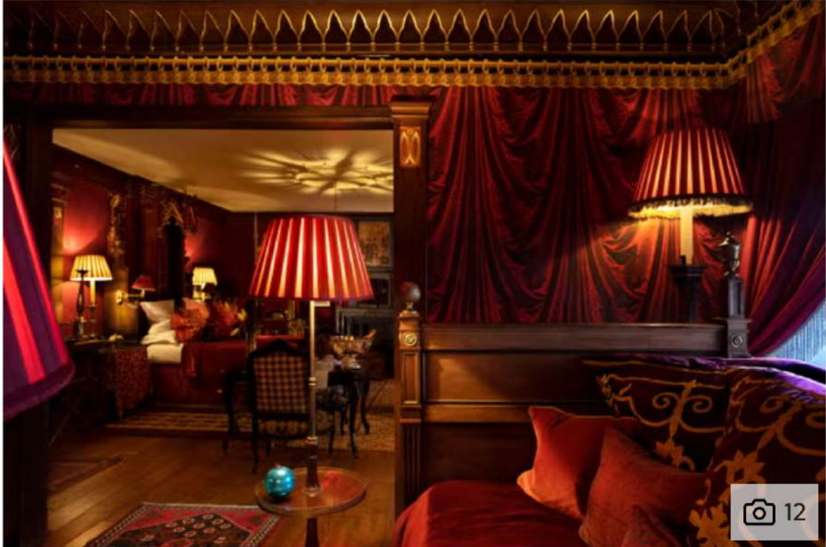
The historic Witchery hotel sits right next to Edinburgh Castle ( David Cheskin )

Footsteps from Edinburgh Castle, the Witchery restaurant and hotel resides in a building dating back to 1595. A bewitching night garden twinkling with fairy lights greets you on arrival and, for dinner, it's a descent down ancient stone steps to a dining room of medieval splendour illuminated by candelabra. Each of the decadent eight bedrooms continues the medieval theme with rich oak panelling, four-poster beds with thick curtains and walls draped with tapestries.